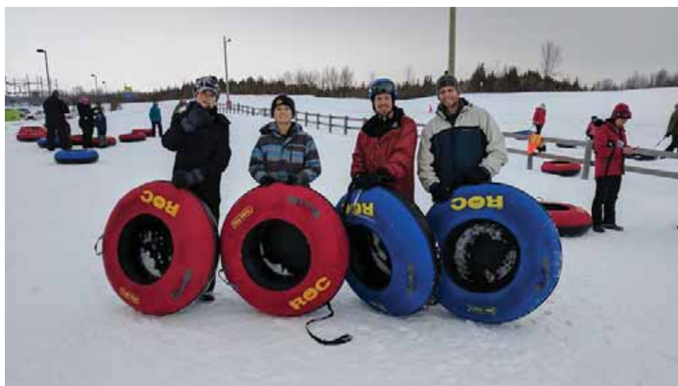
[Tubing at the Georgina ROC]