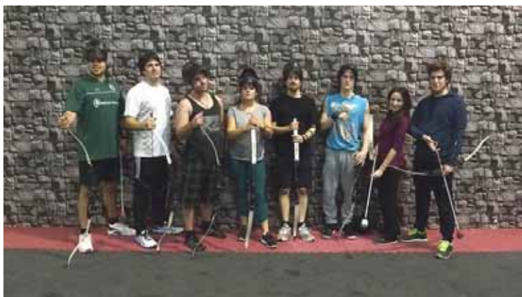
[Young Adults' Archery Tag pose]